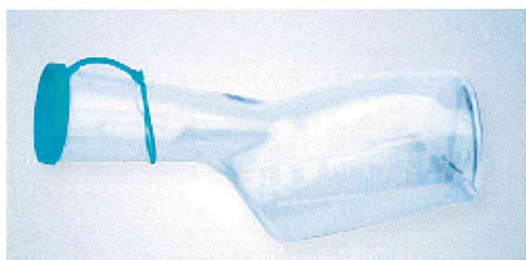
Urinals for men made of PC