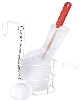
Urine bottles set