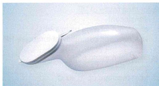
Urinals for women made of PP with cap made of PE